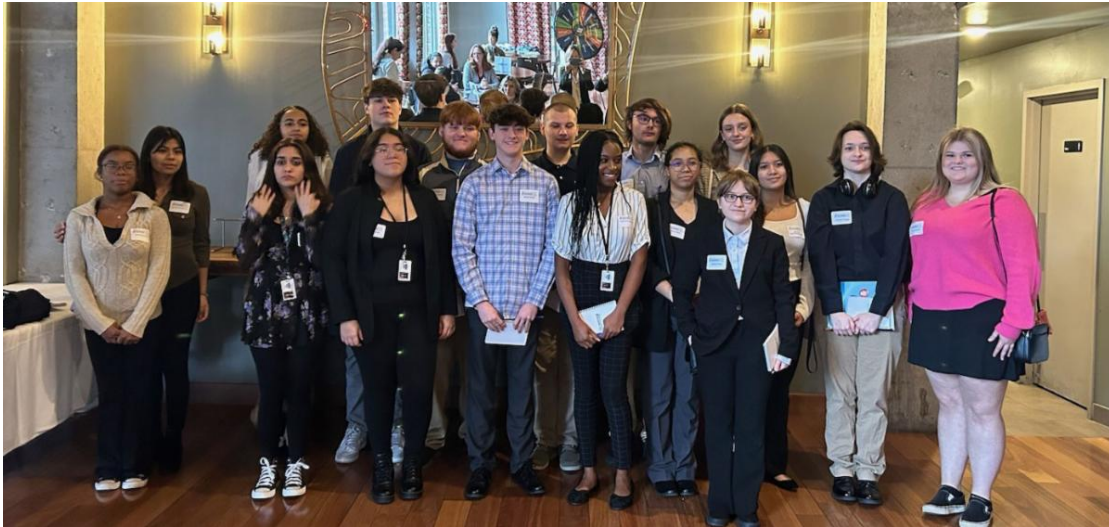
Students in our new JA Company Insight program with GUARD Insurance

We are thrilled to announce the launch of a new pilot program, called JA Company Insight , in collaboration with Wilkes-Barre Area School District and Berkshire Hathaway GUARD Insurance Companies, Wilkes-Barre, to provide students in Wilkes-Barre Area's Business Academy a better understanding of the types of jobs available in the insurance industry and the requirements for various positions at GUARD.